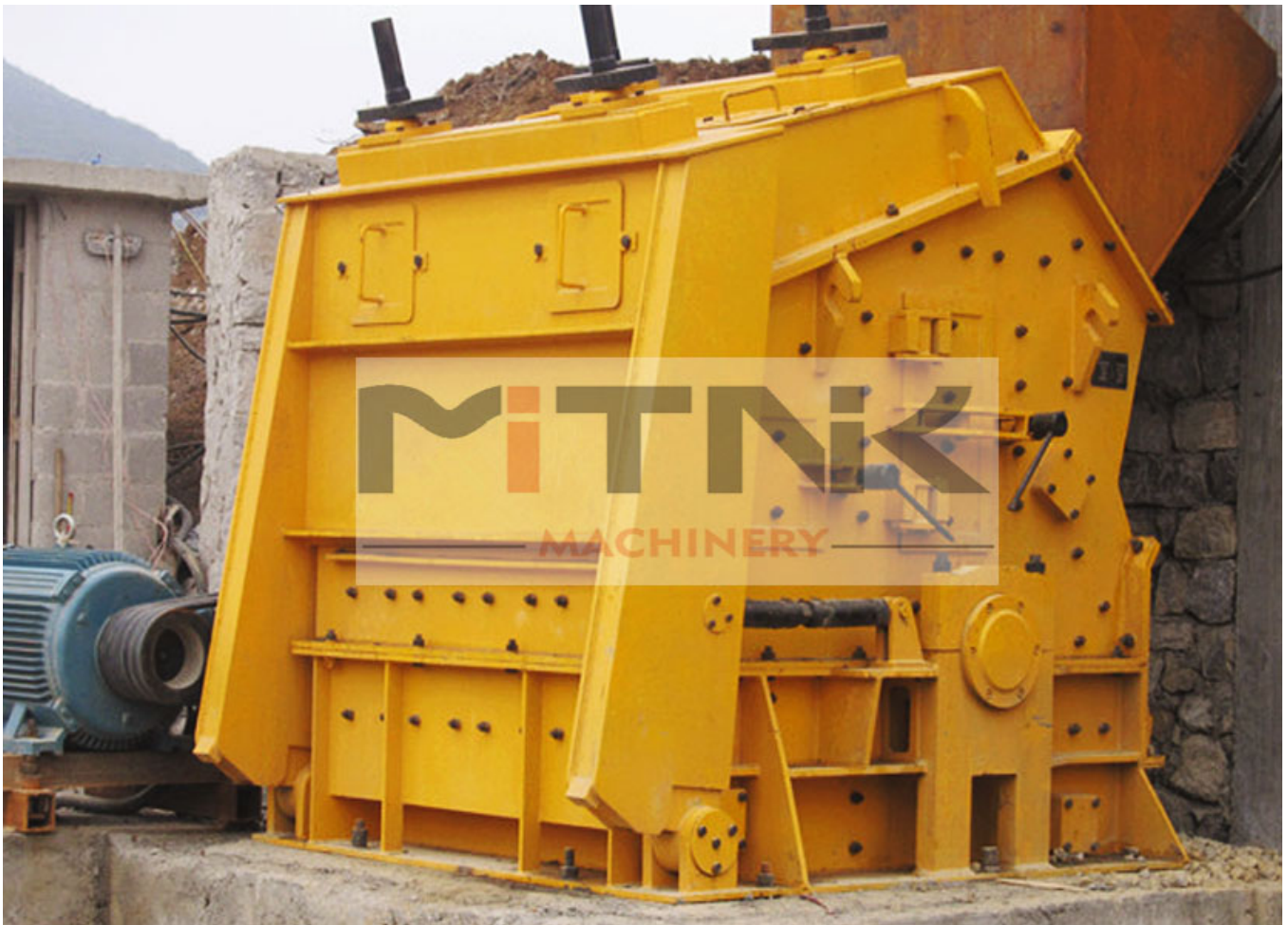
PFW Impact Crusher

The design of three chamber crushing makes the PFW crusher perform well in the fine crushing and superfine crushing operation, and the design of the two chambers simplifies the flow chart of coarse crushing operation.